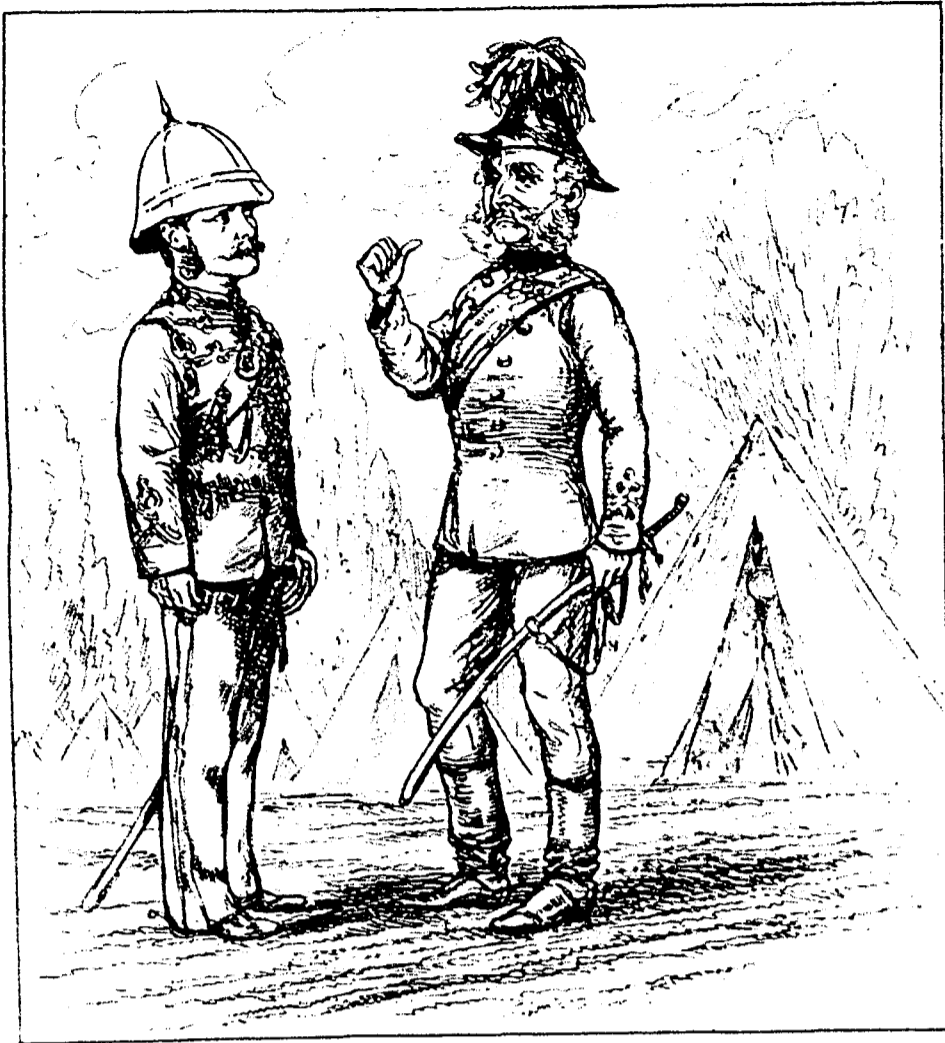
A TIMELY SUGGESTION FOR DOMINION DAY.