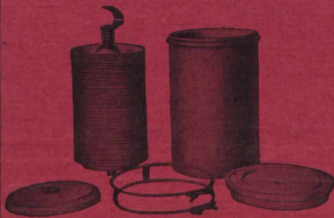
Type A Electrolytic Arrester, dismantled.

The aluminum trays are filled with electrolyte and lowered into place in the steel tank, which, in turn, is filled with transformer oil to within a few inches of the top. The oil furnishes insulation to the arrester, and at the same time prevents evaporation of the electrolyte, and also acts as a cooling medium in operation.