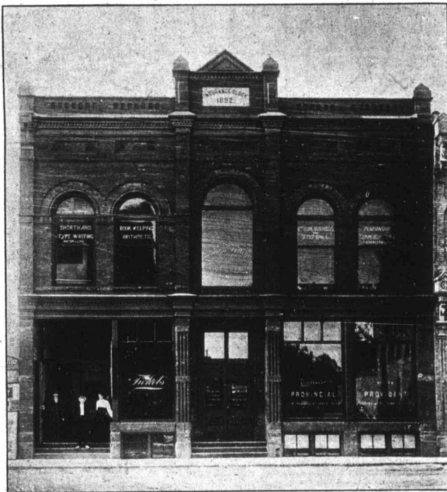
ST. THOMAS BUSINESS COLLEGE