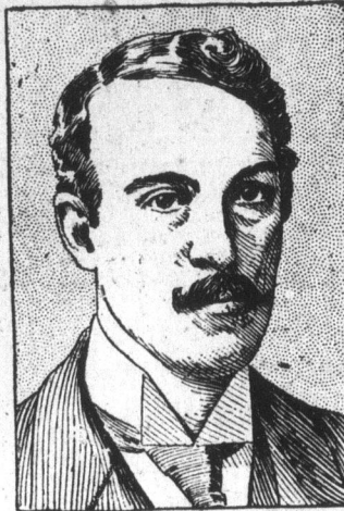
RIGHT HON. ARTHUR LYTTELTON.

Yesterday in the great Liberal and Labor landslide fifty-six seats were decided. At the start of the contest forty-three were held by Conservatives