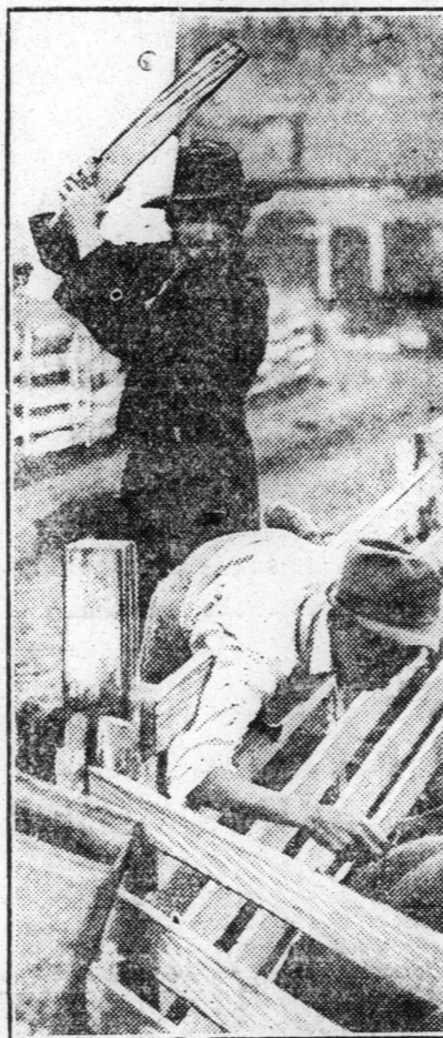
Applies the Barrel Stave to the Bent Over Negro Lad.

"We are proud, but that very pride imposes a price of maintenance. Schiller said perfect peace was for a world of angels; but an exhorting Bryan or a pacific Carnegie cannot raise us to that dizzy realm. We must go to the root of the matter of spiritual got to grow to that stage of spiritual evolution like the oak, not the orchid, and have our roots firmly planted in solid soil before we can raise our heads confidently in the face of life's storm. The price of peace for us is unquestionably preparedness. We cannot afford to lose sight of this even for a moment."