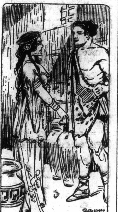
"You will be safe here until tomorrow night," she said.

Spill everywhere. In boxes, 25 cents. The largest sale of any medicine. The directions with every box point the way to good health.