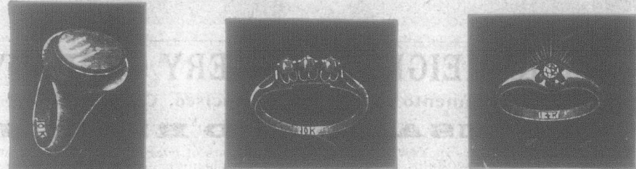
No. 15—Price, $7. Blood or Sardonyx, Masonic Emblem, 25c. extra. 11 New Subscribers. No. 16—Price, $5.50. 3 Turquoises, 8 New Subscribers. No. 17—Price, $10.00. Real Diamond, 14 Karat Gold, 18 New Subscribers.

The above are all guaranteed 10 karat gold, with the exception of No. 15, which is 14 karat.