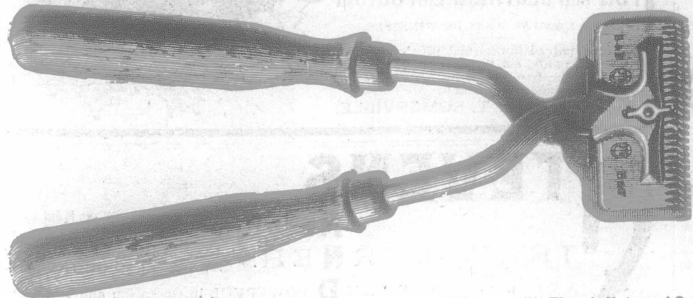
HORSE CLIPPERS.—Best Genuine French Newmarket Horse Clippers, with Thumb Nuts and Set Screws, with Movable Blades, all parts interchangeable. For Five New Subscribers.