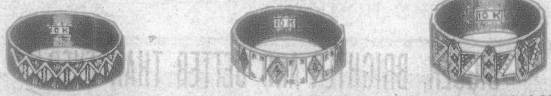
No. 8—Price, $2.00. 3 New Subscribers. No. 9—Price, $2.00. 3 New Subscribers. No. 10—Price, $4.00. 6 New Subscribers.