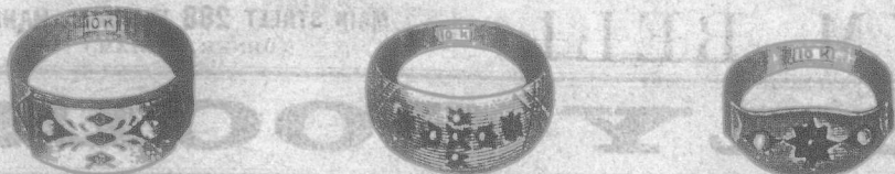
No. 5—Price, $3.50. 2 Pearls, 3 Garnets, 5 New Subscribers. No. 6—Price, $3.50. 2 Garnets, 5 Pearls, 5 New Subscribers. No. 7—Price, $3.50. 1 Garnet, 2 Pearls, 5 New Subscribers.