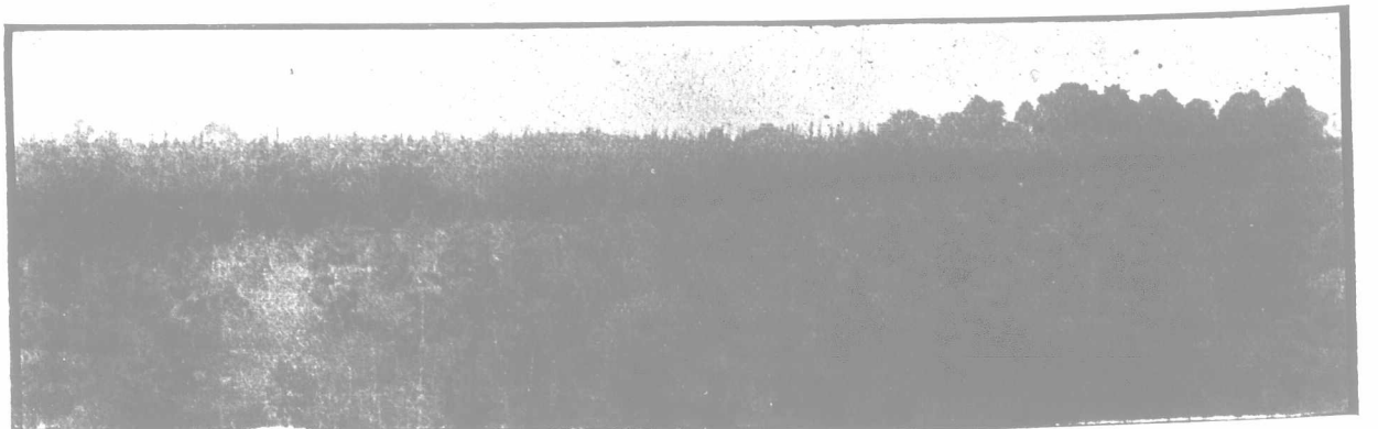
Pines on Blow Sand.