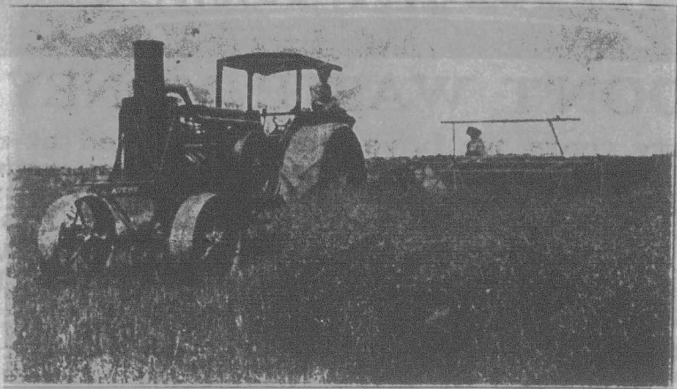
The "Avery" Tractor The Motor of the "Avery" Tractor is built particularly for tractor use. It has all the power that is required for severe farm use and much to spare for emergencies. The Construction is Simple. The owner can easily make his own adjustments or repairs. The "Avery" motor is powerful, easy to operate, and economical.