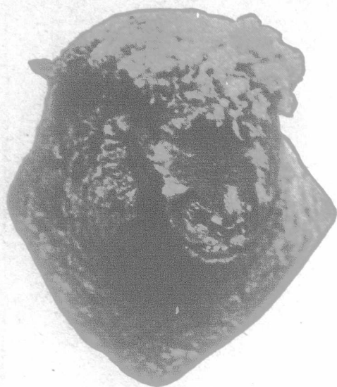
The Sheep for the Producer, Butcher and Consumer. Our Oxfords Hold an Unbeaten Record for America.

We have at present a choice offering of yearling ewes and rams, as well as a lot of good ram and ewe lambs—the choicest selection of flock-heads and breeding stock we have ever offered. Look us up at the exhibitions.