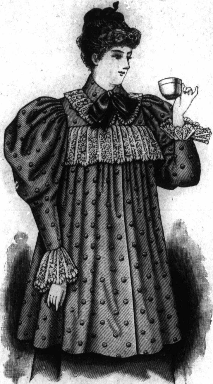
FIGURE No. 269 K.—LADIES' MATINÉE. FIGURE No. 269 K.—This illustrates Ladies' matinée No. 7029 (copyright), three views of which may be obtained by referring to page 2. Rose polka-dotted cashmere, and white lace edging were selected for the development of the garment in the present instance, and edging and a ribbon bow provide the effective decoration. The pattern is in 10 sizes for ladies from 28 to 46 inches, bust measure, and costs 25 cents. To make the matinée for a lady of medium size, requires 7½ yards of goods 22 inches wide, or 5½ yards 30 inches wide. Of material 44 inches wide, 4¾ yards will be sufficient.