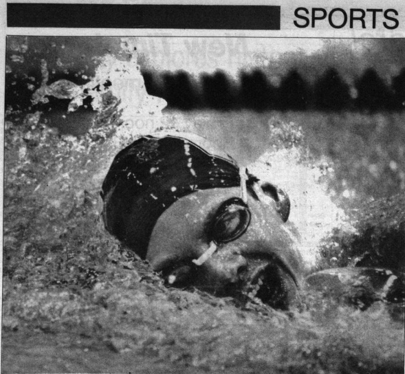
The West pool was frothing Saturday as the Bears mauled the U of W Huskies