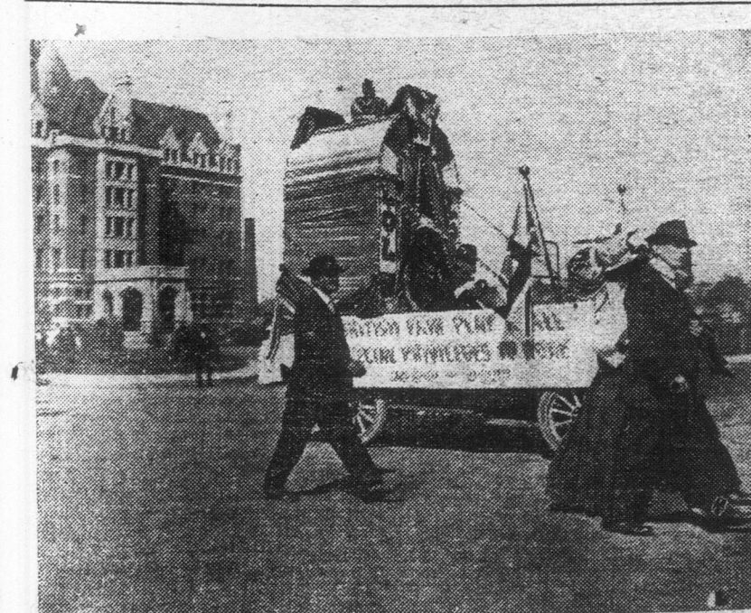
DECORATED FLOAT IN PARADE One of the features of the celebration of the Twelfth

will be dealt with this week by the back, but the flames forced him back, (Concluded on page 4.)