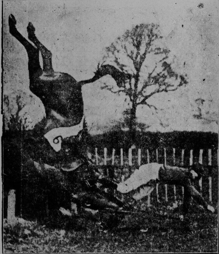
After this nasty spill on an English race course the jockey remounted his steed and rode home in second place.

Fisherman Have Close Call in Fog and Rain—Separated From Vessel Far From Highland Light.