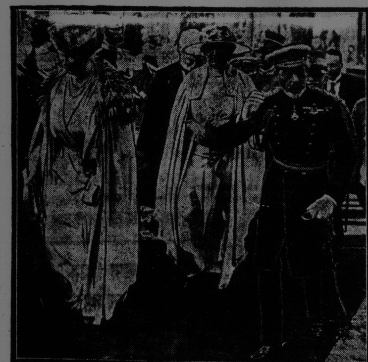
One of the most interesting views of the royal visit to Italy, showing the King and Queen with their hostess, Queen Elena.