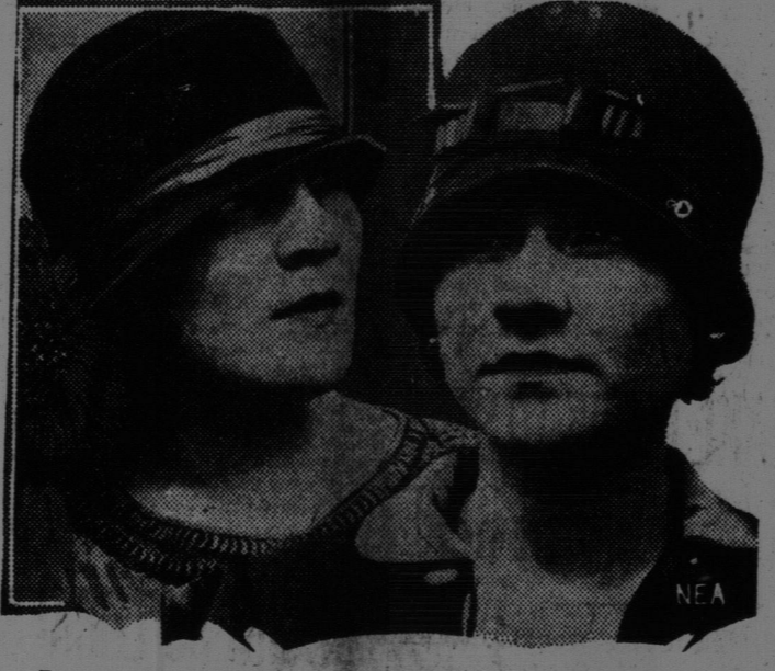
MONTAGUE NORMAN IS RECOMMENDED