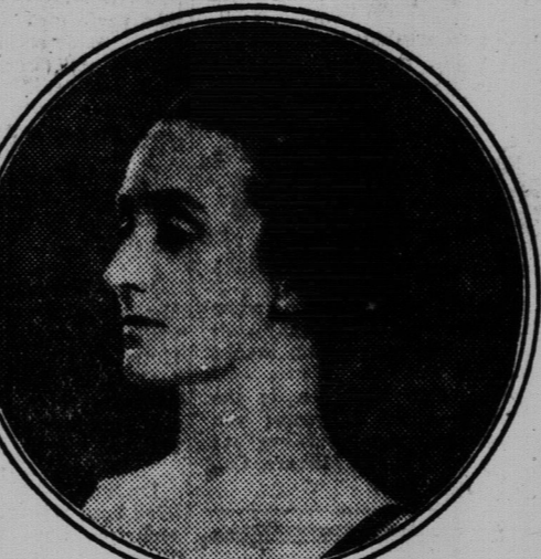
THE PRINCESS MATCHABELLI renowned for her statuesque beauty and distinguished by a name nine centuries old. Admiring the complexions of American women, she says:—"Women everywhere can acquire the same perfection with the use of Pond's Two Creams."

WOMEN of royal blood, of noble birth, of high position! Their destiny demands that they face the world with skin as clear and delicate as dawn. Following their lead, thousands of other women, cherishing no less their youth and beauty, pursue a time-tested method of caring for their skins, of keeping their fragile loveliness safe from weariness and strain, inclement weather, grit and dust. Pond's is the plan they follow. Pond's Two Creams, the means! Made from formulae developed with scientific toil, with ingredients selected for superior quality, they form a complete method of caring for every normal skin and should be daily used as follows:— First Step: During the day whenever your skin needs cleansing—especially after exposure to weather, wind and dust—apply Pond's Cold Cream generously. Let it stay on a few moments. Its fine oils will penetrate the pores and bring to the surface the dirt and powder which clog them. Wipe off the cream and dirt and repeat the treatment, finishing with a dash of cold water or a rub with ice.