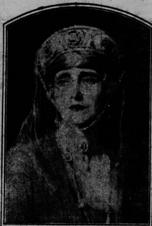
MARIE, Queen of Romania granddaughter of Queen Victoria, stateswoman, author, mother of two queens, and herself the most beautiful queen in Europe, says: "Beauty can be thoroughly guarded by the daily use of Pond's Two Creams."