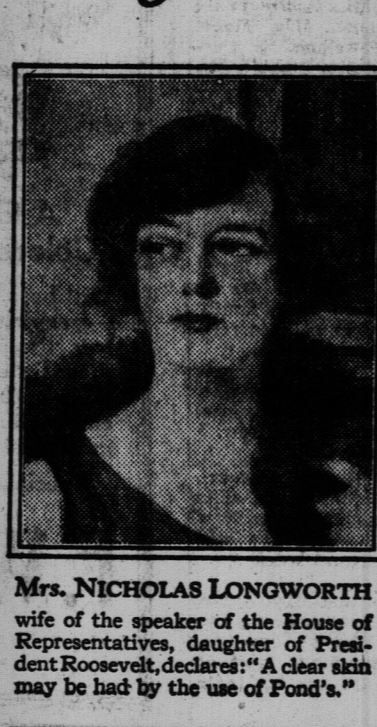
MRS. NICHOLAS LONGWORTH wife of the speaker of the House of Representatives, daughter of President Roosevelt, declares: "A clear skin may be had by the use of Pond's."