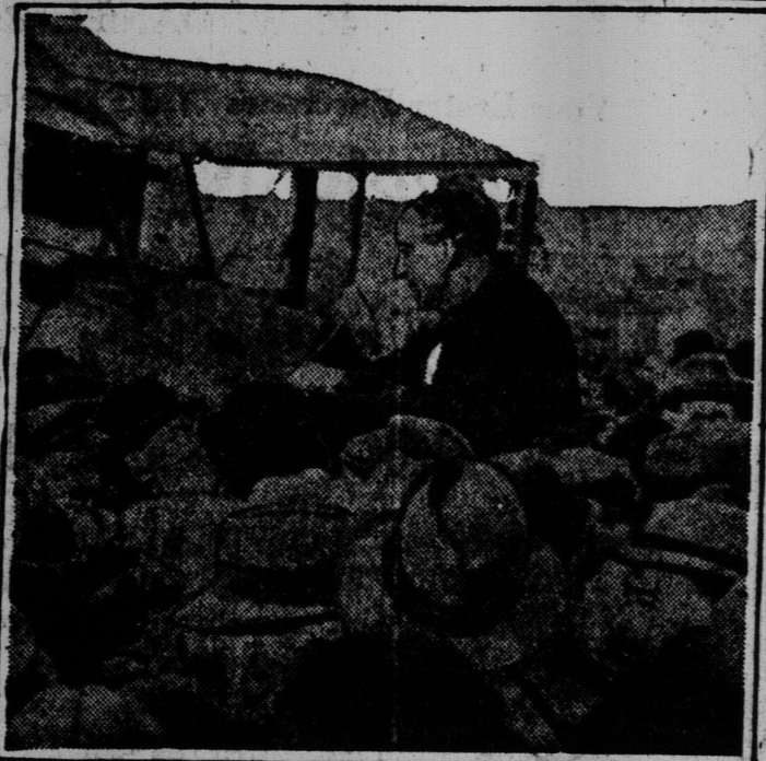
Britain is laying plans for a regular air service between London and South Africa, following the return of Alan Cobham, pathfinder, from his 16,000 mile round trip to Cape Town. Photo shows enthusiastic reception given the voyager on his arrival at the London air-port. Cobham's feat is ranked with the round-the-world flight in importance.

minister would appoint one member of each committee and could scatter largesse to his heart's content.