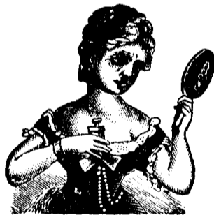
A skin of beauty is a joy forever.

Dominion from Montreal about May 22. Rates of Passage—Montreal or Quebec to Liverpool, Cabin $50 to $80. According to steamer and position of stateroom with equal saloon privileges. Second cabin $30 to Liverpool or Glasgow. Steerage $20 to Liverpool, Londonderry, London, Queenstown, Glasgow or Belfast. Special rates for clergymen. For particulars apply in Toronto to GEO. W. TORRANCE, 18 Front Street West; or C. S. GZOWSKI, JUN., 24 King Street East; or in Montreal to DAVID TORRANCE & CO., General Agents.