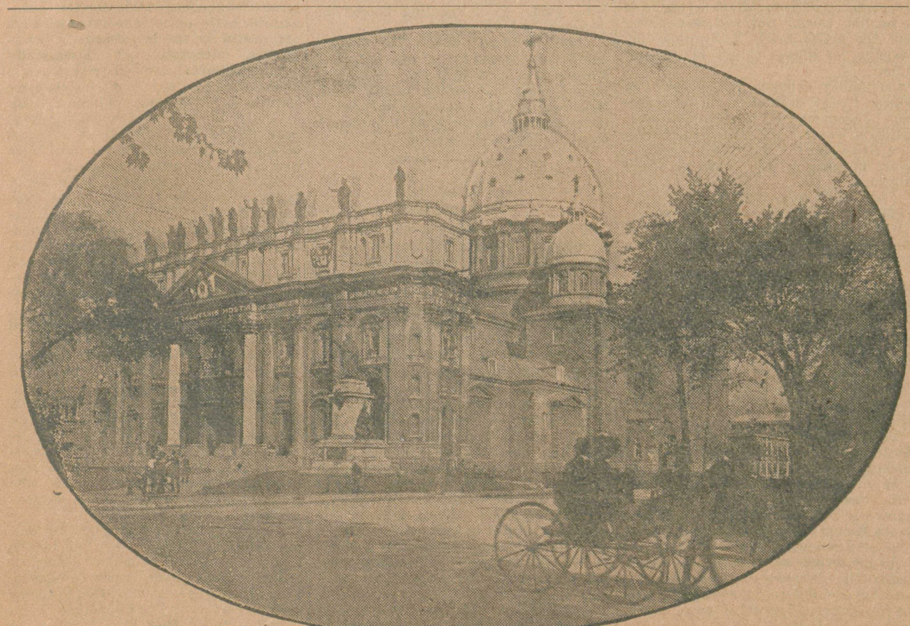
St. James' Cathedral, Montreal, where Cardinal Vannutelli Delivered the Pope's Message

"Is further illustration needed? If it were needed, is it not furnished in those days in this royal city-this city, royal and loyal, first of all to its Eucharistic Saviour. Have you not "What tongue of man can voice the sentiment of faith which at this moment that Mount become in these latter days here present, revealing the presence of the far distant Rocky Mountains there the Son of God under the veil of the is set upon one of the highest slopes a Eucharist. As truly as on that first great white cross. They call that Christmas night the tender Child of mountain the Mountain of the Holy Mary lay within her loving arms, as Cross, and for miles and miles all truly as when in Judea, He sat upon around the symbol stands an emblem wonderful truths of God, as truly as source of wonder for all passers by. when He healed the leper and fed the multitude and gave sight to the of nature while on this Mount Royal blind, as truly as when at last He was has been set the gift of God-the CONTINUED ON PAGE FIVE