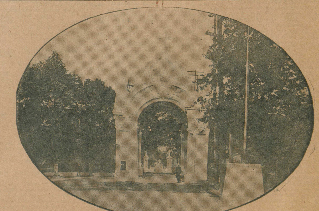
View of St. Hubert St. and Arch through which Great Eucharistic Procession Passed