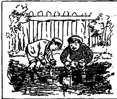
THEY LIKE WATER.