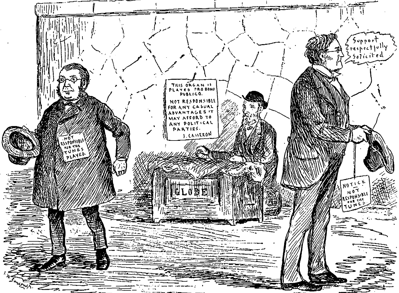
THE ORGANIST AND THE LEADERS.

Photographer, 134 Yonge Street, Toronto.