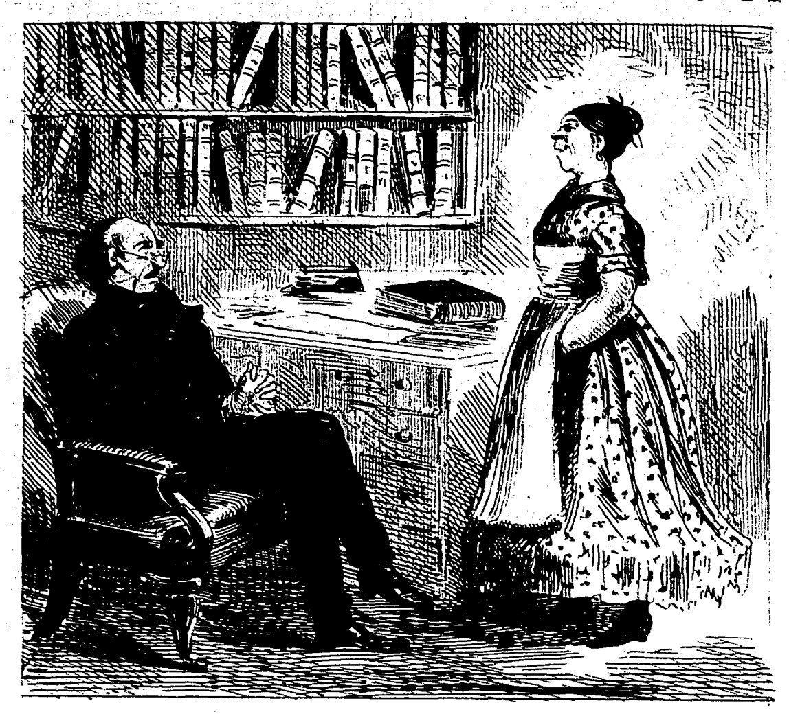
OLD REGULUS .- " It is necessary, Bridget, that you should inform me of your age and origin that I may comply with the law in filling up the census.

BRIDGET .- " Is it me age ye're wantin' to know, sir? An' faith I've often heerd me mother say I was born the same day as Mrs. Maloney's Pat that killed hisself wid drink; but me origin, faith! yer honour, I'ven't the laste idea of me origin."