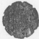
Lang's Lay or ordinary Patent Flattened Strand Winding or Hauling. Patent Flattened Strand, (non spinning)

DRAWERS OF all Sections STEEL-WIRE. HIGH CLASS for Ropes, Springs. Pianos, Needles, Fish-Hooks Binding Armatures and all other Purposes.