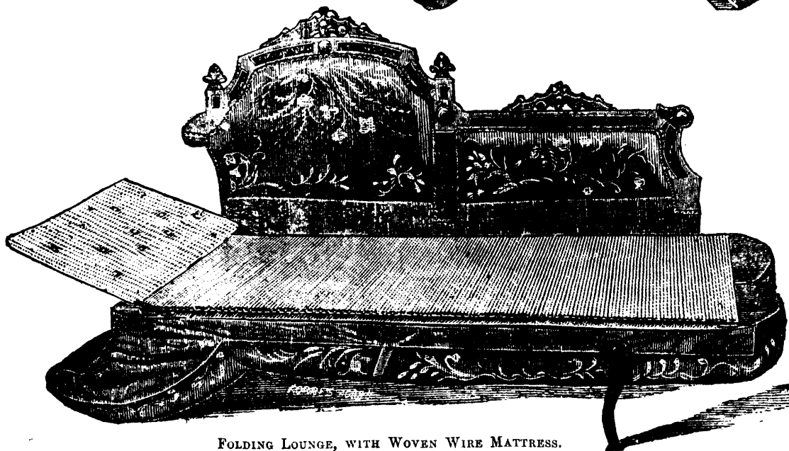
FOLDING LOUNGE, WITH WOVEN WIRE MATTRESS.