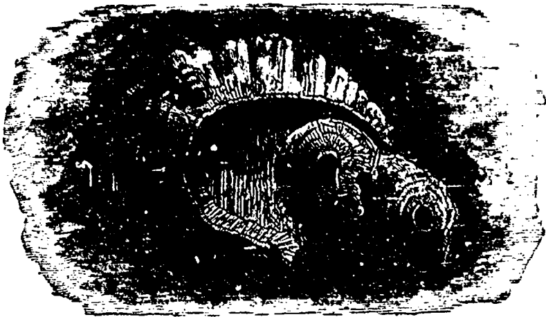
PIRD'S-EYE VIEW OF VOLCANO AND VOLCANELLO; OR, PRIMARY AND SECONDARY VOLCANO.