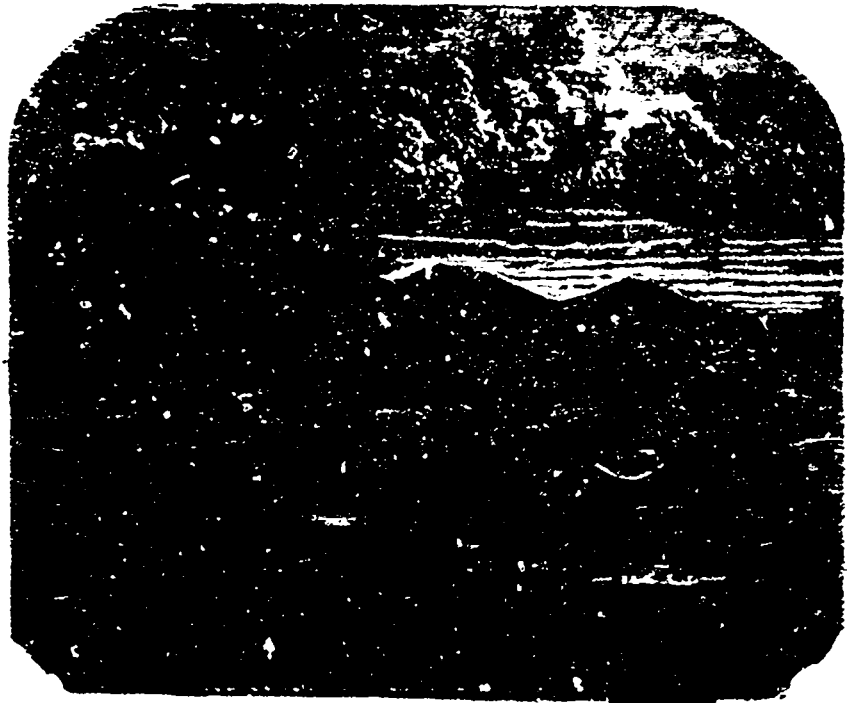
WELLS CAUSED BY EARTHQUAKE.