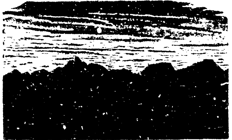
EXTINCT CRATERS IN AUVERGNE.

and its mountain-building work were both strikingly illustrated in the formation of Monte Nuovo, on the shores of the Bay of Naples, a few miles north of the city, in the year 1538. From a spot of level ground, we are told, water, at first cold but afterwards warm, began to issue; then the earth cracked open, showing incandescent matter within the fissure. Soon masses of stone, with vast quantities of pumice and mud began to be thrown up to a great height, and this continued for two days and nights, forming a hill more than four hundred feet high. Less violent eruptions followed at intervals during the next five or six days, when the volcanic action ceased, and the place has been undisturbed ever since. Monte Nuovo is now a smoothly rounded hill, covered with a dense growth of pines