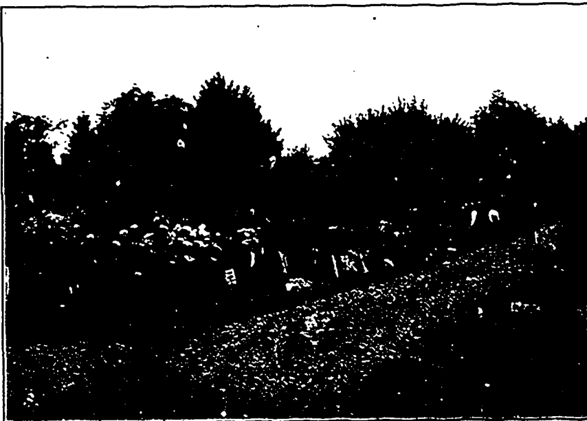
A View of the Calceolaria Border at the Guelph Agricultural College

Raspberries should have all the old canes cut away. The young canes which are to fruit next year will stand the winter all the better for the ripening they will get by the increased exposure to the sun as a result of cutting away the old canes. Raspberries that are tender