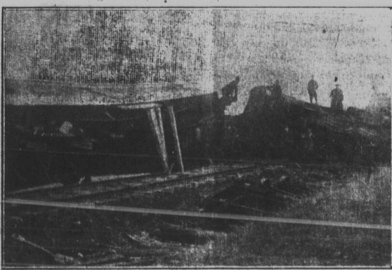
THE WRECK "LOOKING EAST"

From the evidence of foreman Devereaux it was shown that the engine was making its first run after being in the shops for repairs, these repairs being in no way connected with anything that might cause de- railing. As far as he knew, his opinion was that the engine was in good condition, having no wheel trouble of any kind.