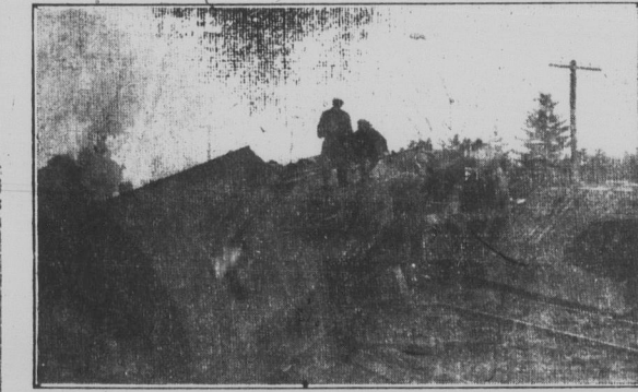
THE WRECKED ENGINE

CHILDREN'S SUITS Large variety of Children's Wash Suits and Romper suits OAK HALL.