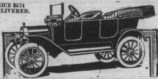
5 Passenger, Ford Touring, 1916