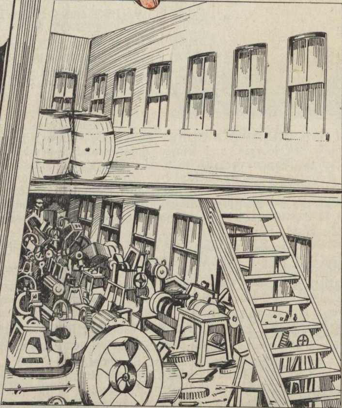
THE OLD WAY