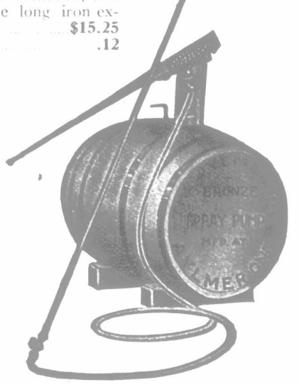
Sprayer No. 2.—Outfit D