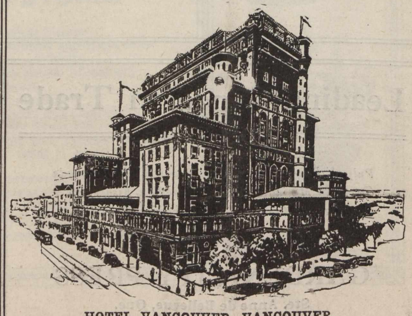
HOTEL VANCOUVER, VANCOUVER.