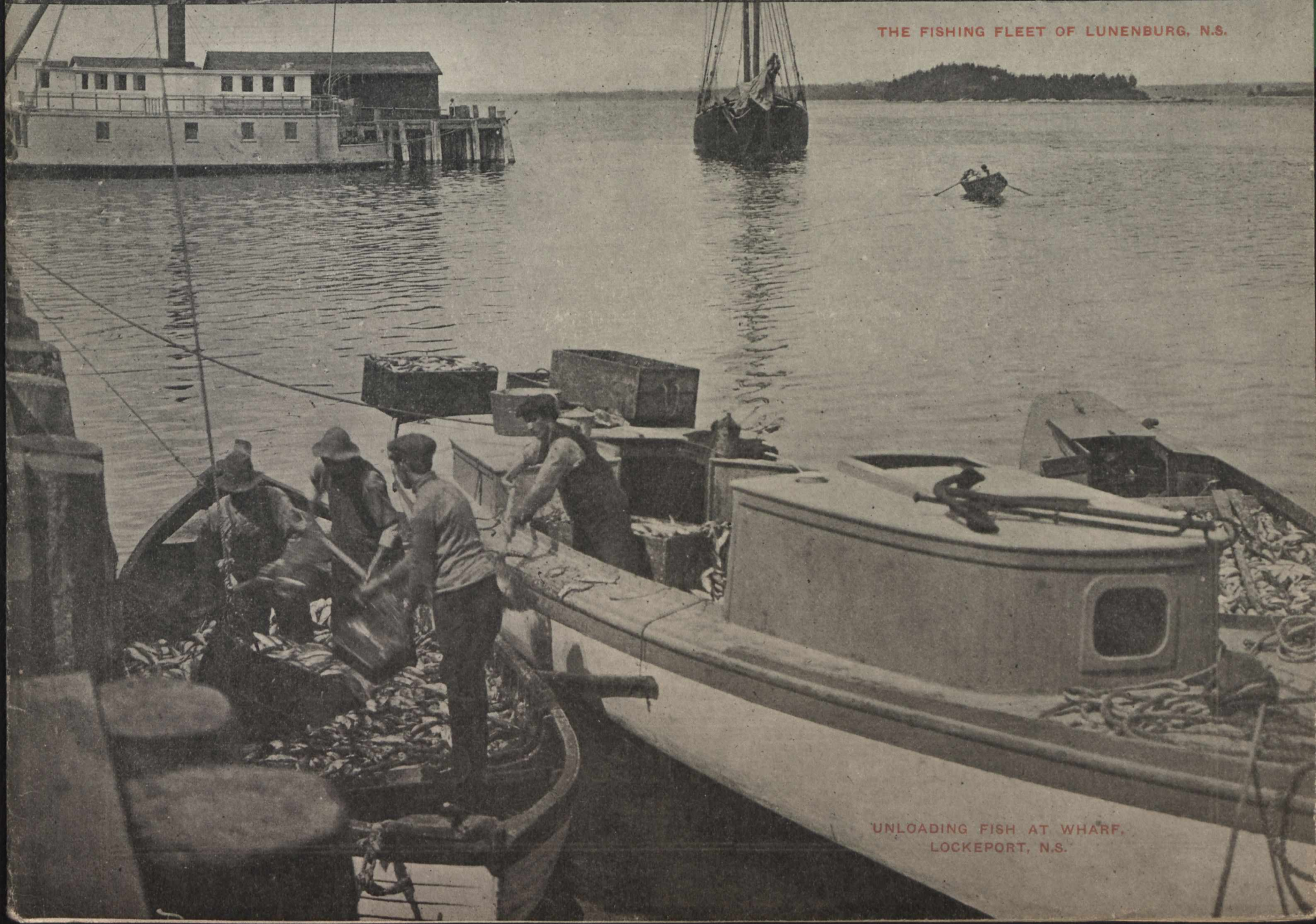
UNLOADING FISH AT WHARF, LOCKEPORT, N.S.