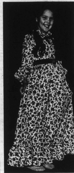
Imka Glas, 7, wore a fine cotton Victorian print with full gathered sleeves and belted with a velvet ribbon.