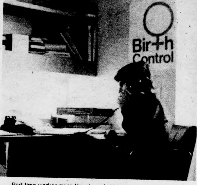
Part-time worker mans the phone in Harbinger reception area.