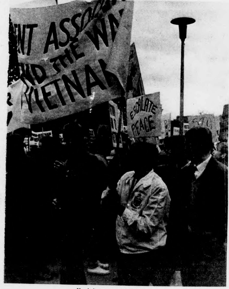
York has peaceniks too!

Although several protesting placards were placed by York's Young Socialist movement in a hall behind the dining area, the owners were conspicuously absent.