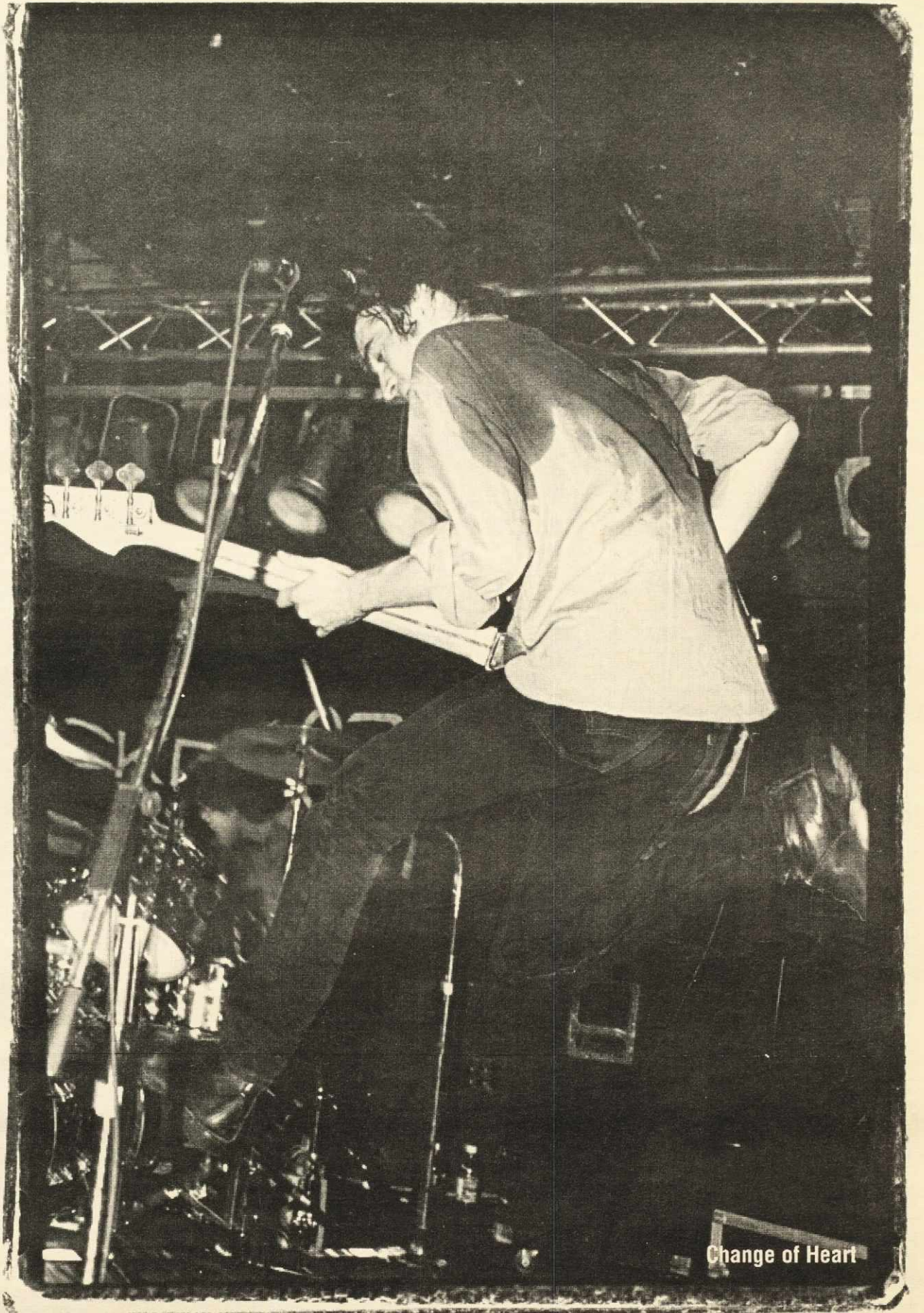
Change of Heart