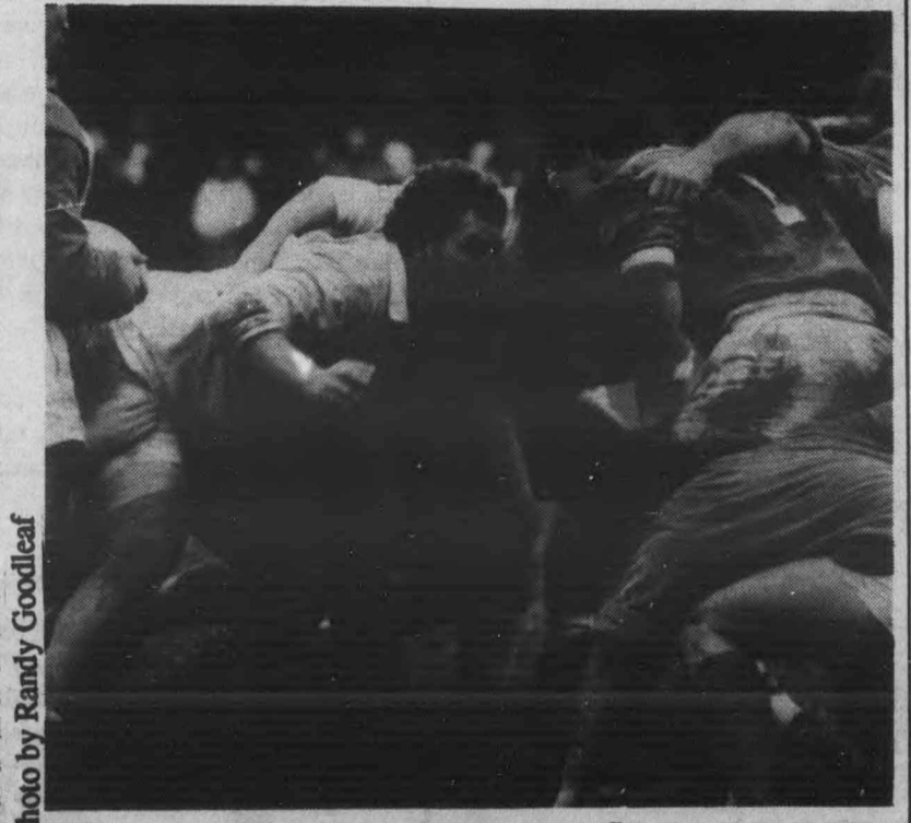
Ironmen in making waves at Cup

further penalty kick by Bruce recognition must go to Co- back; fitter, stronger, and much