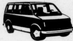
GMC Safari Passenger Van