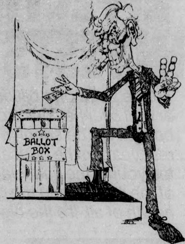
The politician knows his real job is to get elected.

The moment to take the initiative and build a Student Union of which we may all be proud has arrived. As of today, I am running for the presiden-