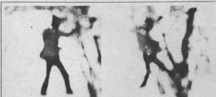
This mysterious figure was seen yesterday in Quad. See story, page 3.