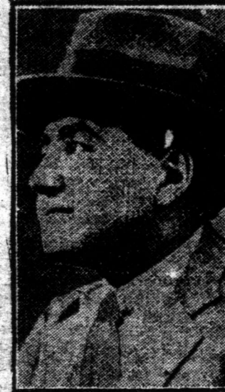
SHAH OF PERSIA.