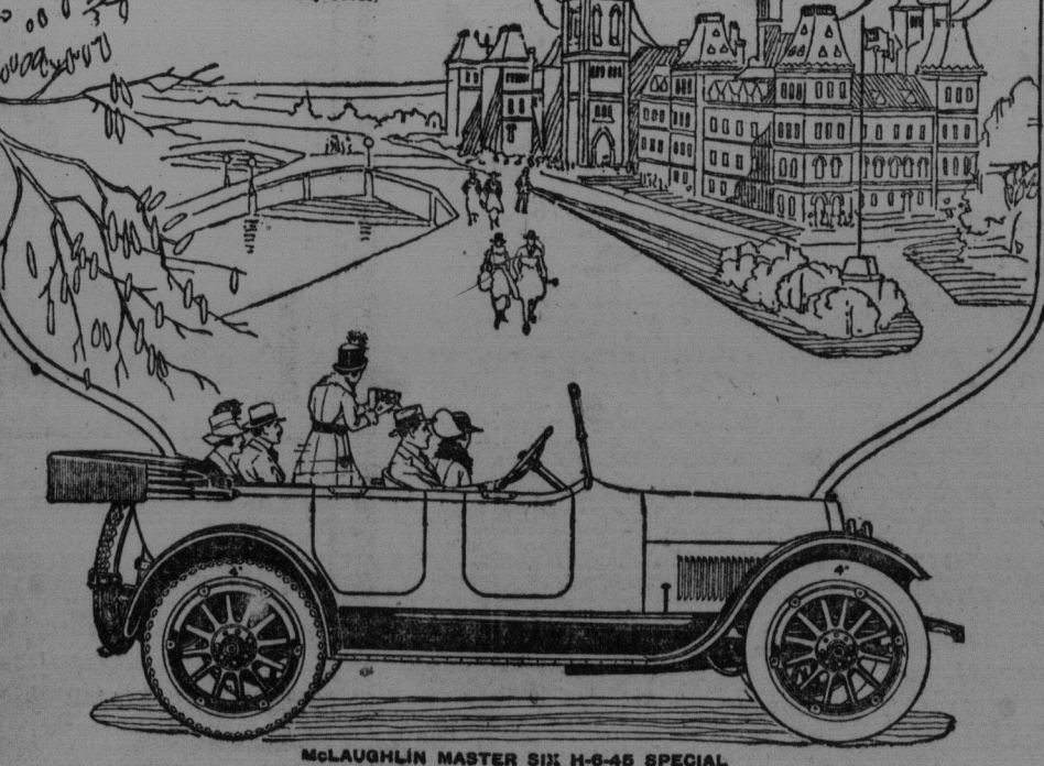
McLAUGHLIN MASTER SIX H-6-45 SPECIAL

The McLaughlin Motor Car Co. OSHAWA, ONT.