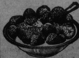
Made in Canada.

Open Up a Health Account that will yield greater enjoyment of life and higher efficiency in work. Cut out heavy winter foods and eat Shredded Wheat Biscuit with fresh fruits and green vegetables. Shredded Wheat is ready-cooked. Delicious for breakfast with milk or cream; for luncheon or any meal with berries or other fruits.