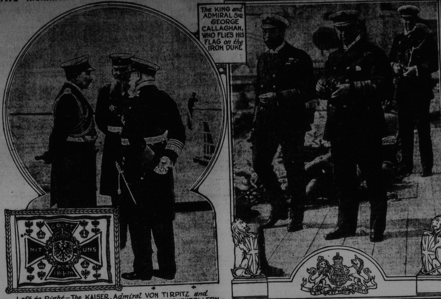
Left to Right—The KAISER, Admiral VON TIRPITZ, and Admiral VON HOLTZENDORFF on BOARD the HOHENZOLLERN—