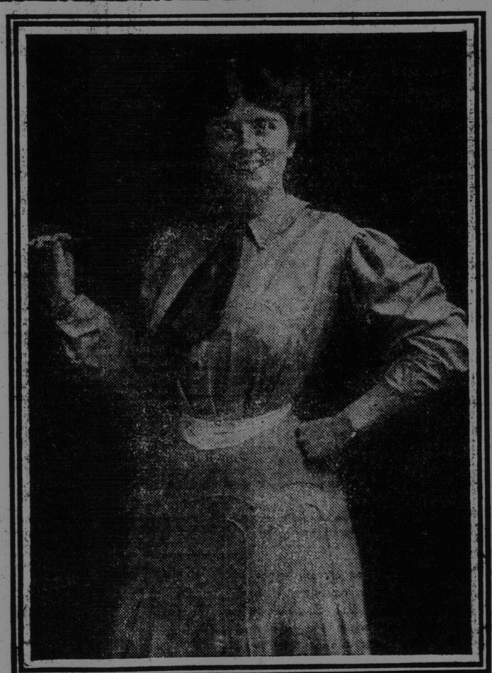
COSTUME OF THE ATHETIC GIRL.

red serge or mohair skirt, neatly stitched and of ankle length, makes an A tailored serge or monair skirt, nearly stitched and of ankle length, makes an ideal accompaniment for the comfortable golfing shirtwaist of rough pongee. This waist fits smoothly and plainly over the shoulders, without plaits, and closes with bone buttons. The conventional shirt sleeves are gathered into the armsize, and the wide wrists are finished with pointed turned-back cuffs. There is a soft turned-over collar and a dark silk Ascot tie, and on the left breast a convenient handkerchief pocket. Tan, taupe and dark blue are excellent golfing costume colors.