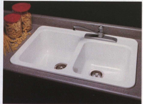
From renovations to new homes, this colourful line of acrylic kitchen sink has everything — built-in quality, superior finish and convenience.

Best-sellers at home and abroad, Canacrylic products meet consumer demand for quality craftsmanship and style at an affordable price.