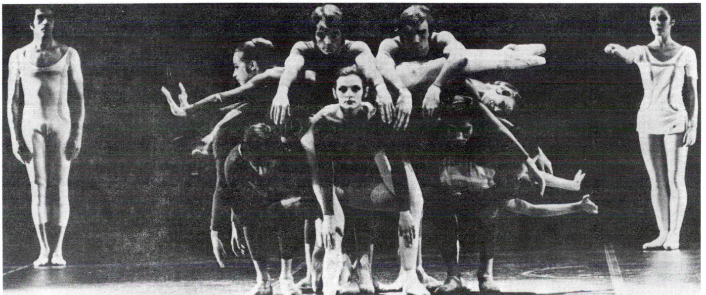
Dancers of The Royal Winnipeg Ballet in Rondo – Part II of John Neumeier's evening-length ballet trilogy Pictures.