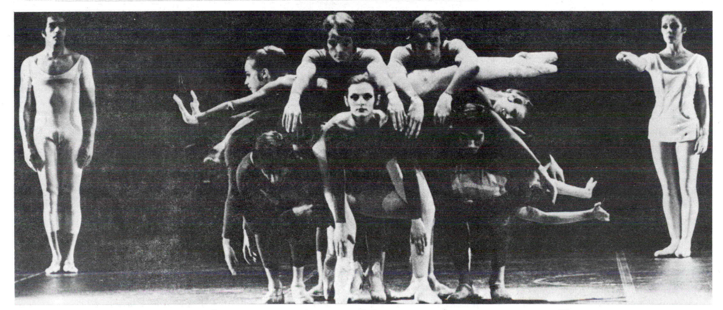
Dancers of The Royal Winnipeg Ballet in Rondo - Part II of John Neumeier's evening-length ballet trilogy Pictures.