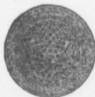
Locked Coil Winding Cable.

Manufacturers of all Kinds of WIRE ROPES for Mines, Tramways, Aerial Ropeways, Suspension Bridges, Cranes, Elevators, Transmission of Power, Steam Ploughing and General Engineering Purposes.