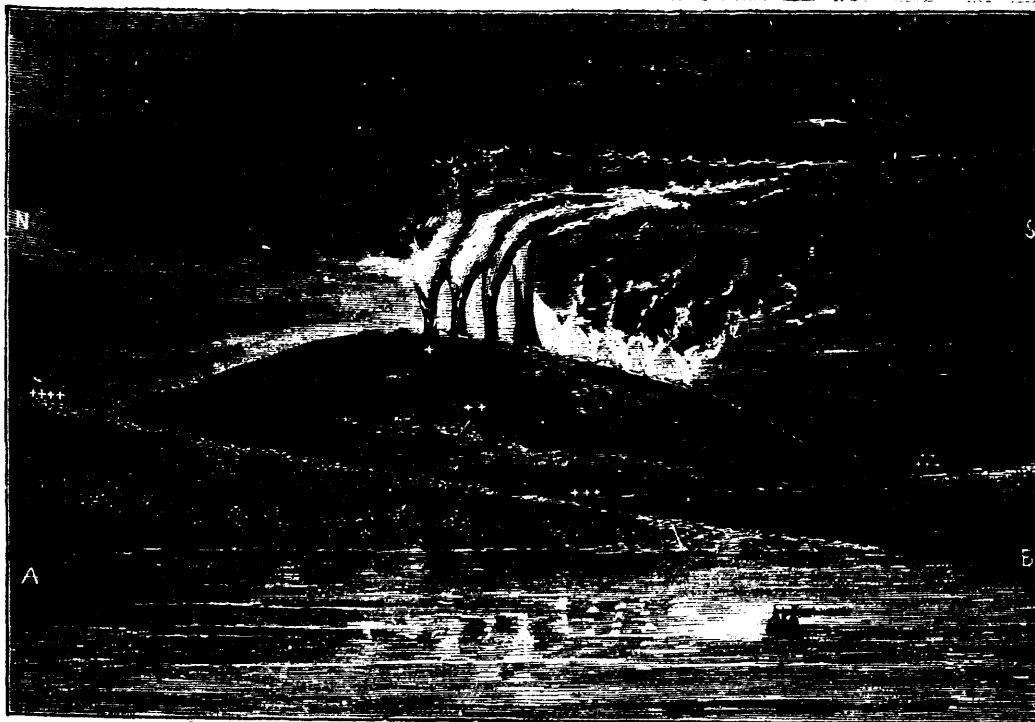
THE GREAT ERUPTION AT HAWAII.